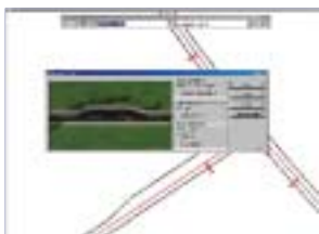
Linear or reverse curve road widening provides full gradient control throughout.