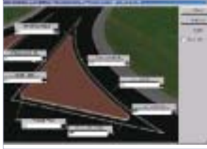
3D traffic islands are easily incorporated into intersection design and analysis.