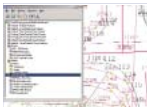
Map features according to custom definitions and easily review using built-in display contents.